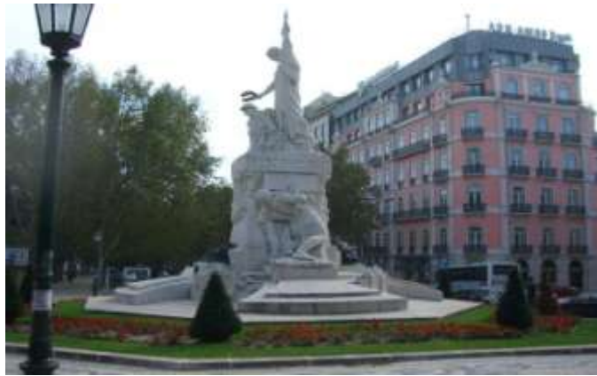
Afterwards we will pass by the Monastery of S. Vicente, the