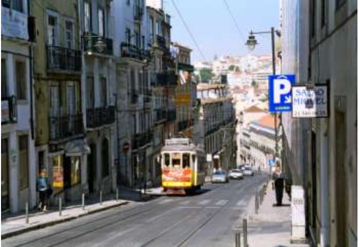
Our last stop will be the Belem district and we will see its several monuments: Monastery of Jeronimos, Belem Tower and Discovery monument.