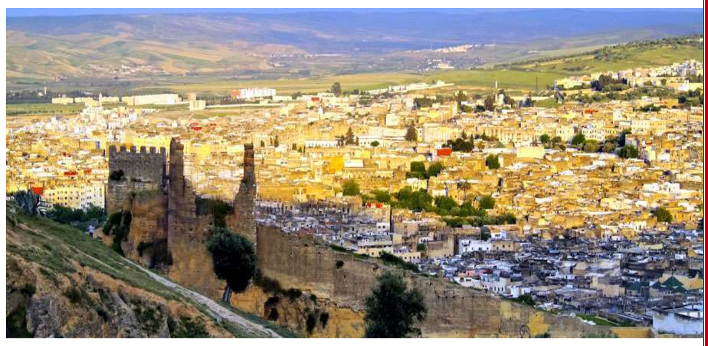
fantastic sights and smells. This is a University City, which had its golden age in the 14th Century, constructed during the reign of the Merinides dynasty.

Breakfast at Hotel. We start early today with a Short Orientation Tour of Rabat, called the Imperial City. Then we continue with a transfer to Fez. This City is packed