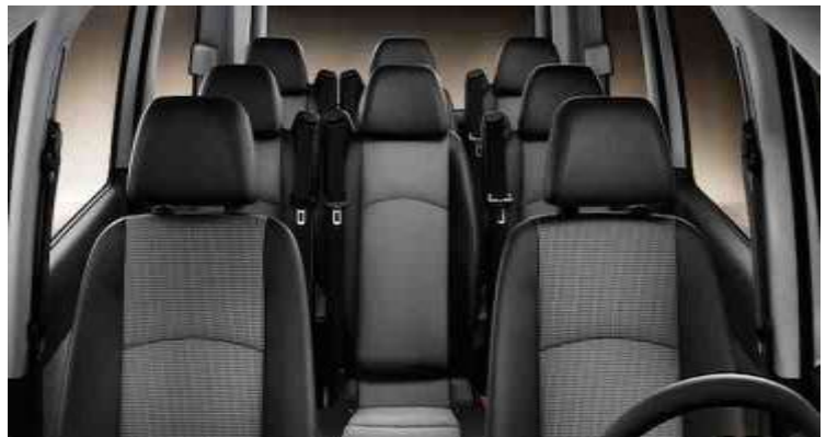
Suitable for 3 pax to 7pax // Leather Interior , Front & Rear Airconditiong //Heating// Tinted Windows//Baggage - Hand Baggage - 8 // Large Baggage - 10