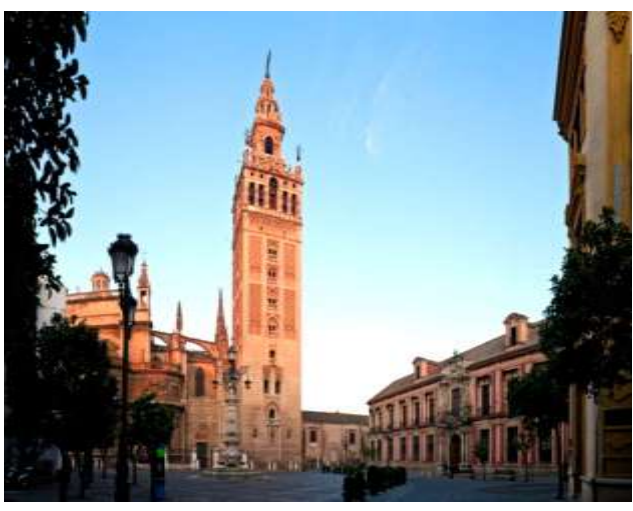
From there we will visit the City's Nautical History Exhibition. The tour will end with Santa Cruz Quarter, known for its